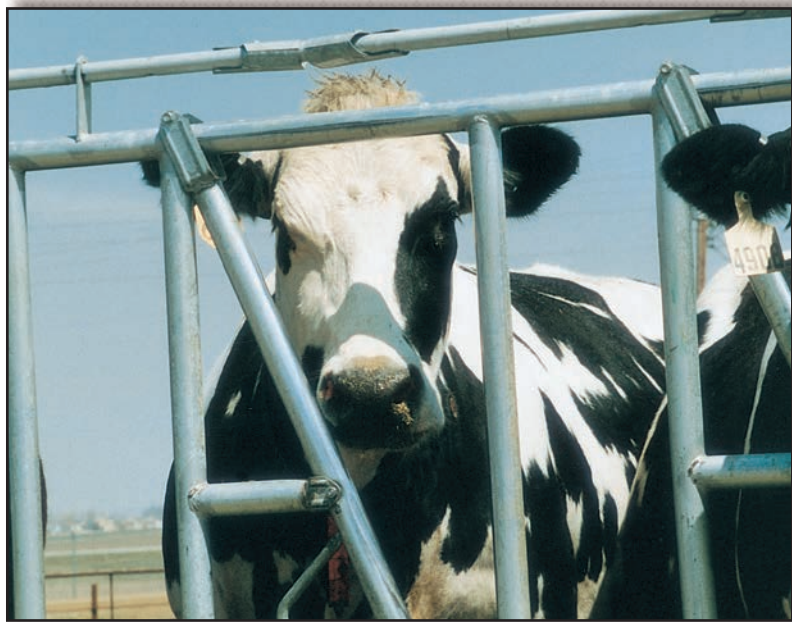
ARE LOCKING STANCHIONS STRESSFUL? It may depend on how the animals were trained to the stanchions. Cows that associate them with feed may have little stress; cows that associate them with needles may have lowered production.

If possible, milkers should not give injections. If this is not possible, then the milker should wear something very different such as removing