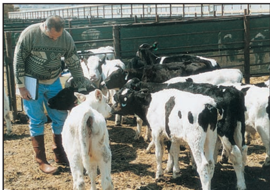
ACCLIMATING HEIFERS TO PEOPLE in this pen may help them to grow up into calmer, more productive cows.

Cows and other animals tend to develop fear memories which are linked to either bad places or prominent objects. Animals are most likely to